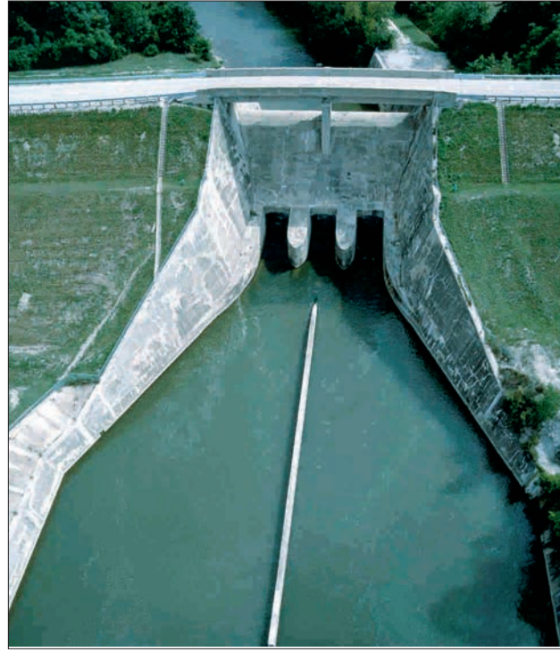
Huffman Dam near Wright Patterson Air Force Base is one of MCD's five flood-protection dams.

It looks calm and peaceful, but a low dam is only 200 feet beyond this boat, well in front of the bridge.