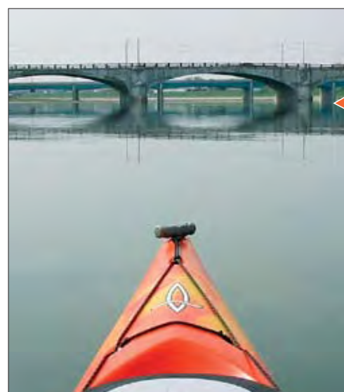
It looks calm and peaceful, but a low dam is only 200 feet beyond this boat, well in front of the bridge.

Unless you are trained in low-dam rescues, never enter the water in an attempt to rescue someone trapped by a low dam. Immediately call for help, then throw a line from shore to the trapped person. Untrained rescuers should never approach the top of the dam or the backwash below the dam, even in a boat. The turbulence at the dam will easily capsize a boat.