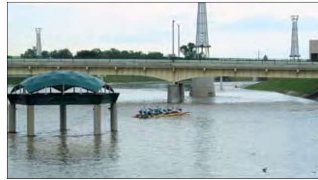
Paddlers should not boat on swollen rivers and streams like this high water on the Great Miami River in downtown Dayton.

Recreation on rivers and streams can be relaxing or thrilling, but most of all it should be safe. Water offers several real dangers, but with proper training, these hazards are easily managed. Boating safety classes that can teach you to handle water hazards are available around the state of Ohio. Contact the Ohio Department of Natural Resources at 1-877-4BOATER or www.ohiodnr.com for more information.