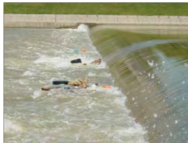
Low dams can be deadly and should always be avoided.

Low dams – like natural waterfalls – are deceptively calm and can be incredibly dangerous. Low dams may range from a 25-foot drop-off to a mere 6-inch drop-off. Water flowing over the dam forms currents that can trap objects and you. Backwash and re-circulating current can trap you back against the dam then underwater before you are pushed along the bottom only to be sucked back to the dam as you rise to the surface. This circulating motion repeats over and over again. The backwash currents may even suck you in if you approach too closely from downstream of the dam. The Great Miami River has 17 low dams, with more than 40 additional low dams on its tributaries.