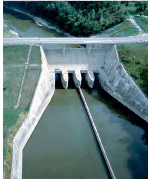
Taylorville Dam near Vandalia is one of MCD's five flood-protection dams.